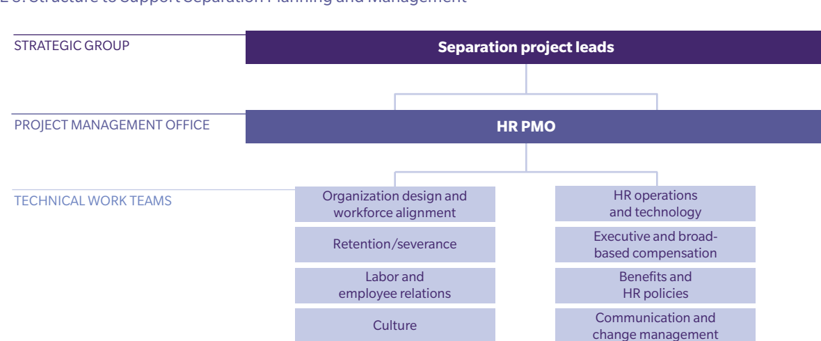
FIGURE 3: Structure to Support Separation Planning and Management

The Strategic Group's Leadership Team steers the separation work, aligning it to the strategy. The team establishes project priorities, has final decision-making authority, and provides guidance to the HR Project Management Office (PMO).